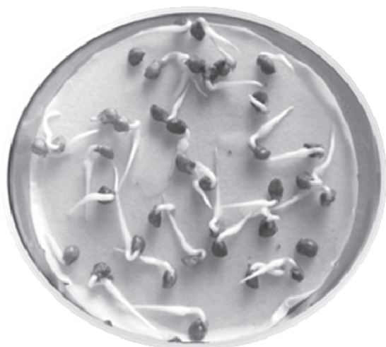
Fig. 1. Sweet potato seeds germinated in the moist petriplate

The hybrid seeds harvested were scarified with concentrated sulphuric acid (H 2 SO 4 ) for 10 minutes. The acid was then decanted and the seeds were removed and properly washed with distilled water for several times to