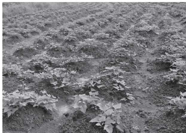
Fig. 2. Field view of F 1 seedlings

A total of 200 F 1 progenies were selected for the present study. The vine cuttings were collected from the nursery maintained in ICAR-CTCRI glass house. Each seedling