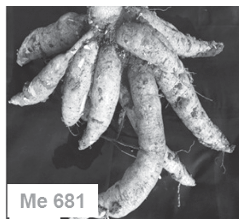
Tuber yield 7.76 kg/plant Starch content 31.00% Best performing accessions for tuber yield and starch content