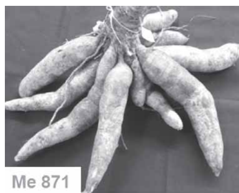
Tuber yield 7.04 kg/plant Starch content 30.10%