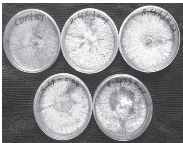
Fig.1. Mycelial growth of T.asperellum on different concentrations of metalaxyl-M+ mancozeb (Ridomil Gold) amended medium

Mancozeb (Indofil M-45) showed 23.0% inhibition at 100 ppm and the inhibition rate positively correlated with the strength of the fungicide. Compared to all other