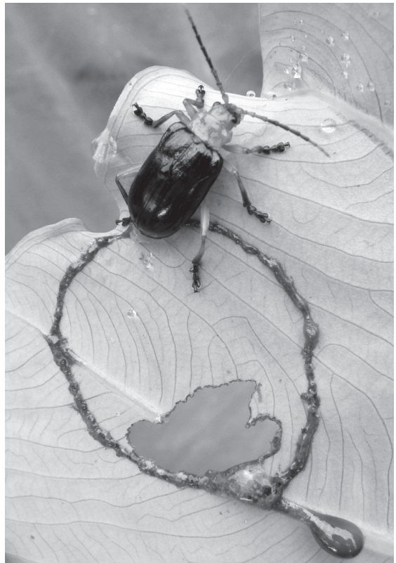
Fig. 5. Circular trenches and the latex