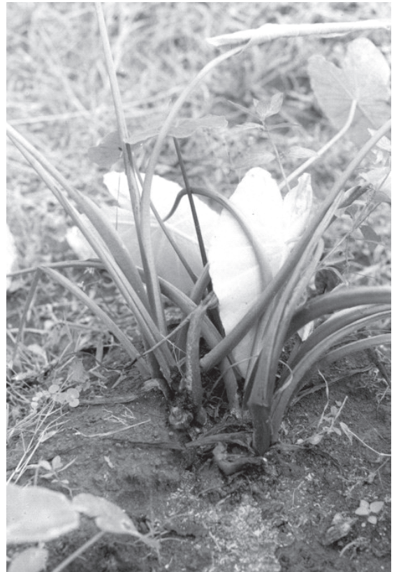
Fig. 4. Corm-borer infested plant