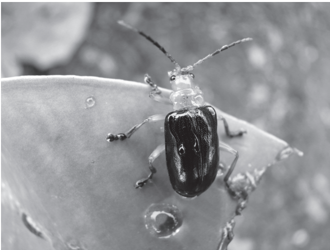
Fig. 1. Corm-borer adult