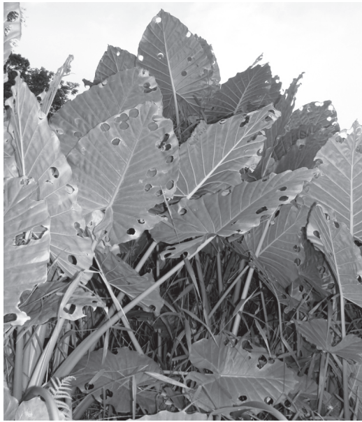
Fig. 6. Wild hosts of corm-borer