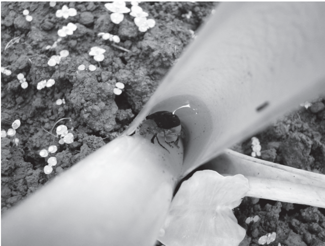
Fig. 2. Corm-borer beetle hiding in the leaf sheath