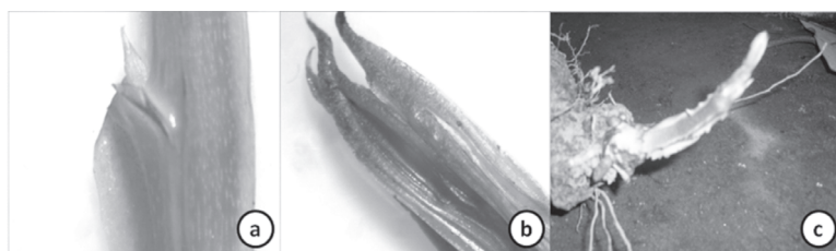
Fig. 1. Different explants used for the in vitro regeneration of D. alata . (a) Nodal segment from field grown plants (b) Apical bud from field grown plant (c) Node from sprouted tubers

Different explants viz. , nodes (1-3 and 4-8 from tip) and apical bud from young and fast growing vines of field grown plants (six months old) and nodes excised from vines of sprouted tubers (less than one week old) were selected for studying their response in cultures (Fig. 1).